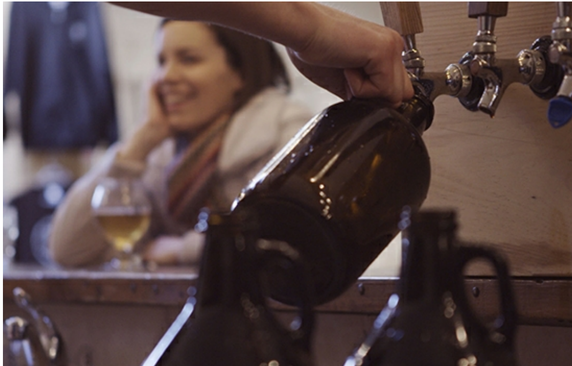
Block Three Brewing Company is worth the drive to St. Jacobs

A distinctive feature of any craft beer is that the personal touch of its brewer tends to be quite obvious. In the past few years, more and more Ontarians have joined the club of brewers, adding their own signature to the local beer scene. In Toronto, beer drinkers have an exciting number of opportunities to taste the interesting new lagers, porters and ales being produced outside the city, but there's not nearly enough retail space for those of us looking to purchase more than a pint or two at a restaurant. That's a compelling reason, I think, to pack the car and spend a few days discovering some of the province's best breweries for yourself.