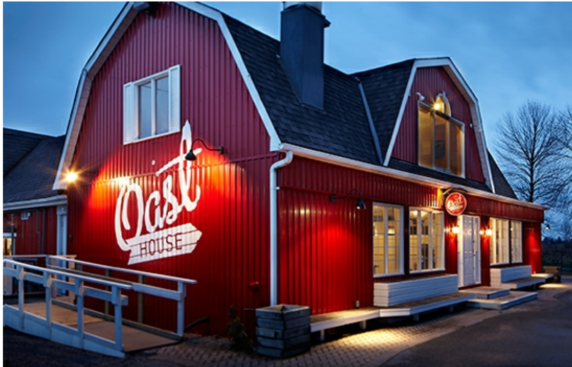
Oast House Brew ers is hard to miss in Niagara